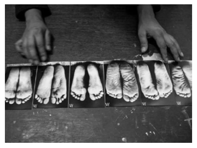
Photography workshop at Artudio, Swoyambhu, 2018.